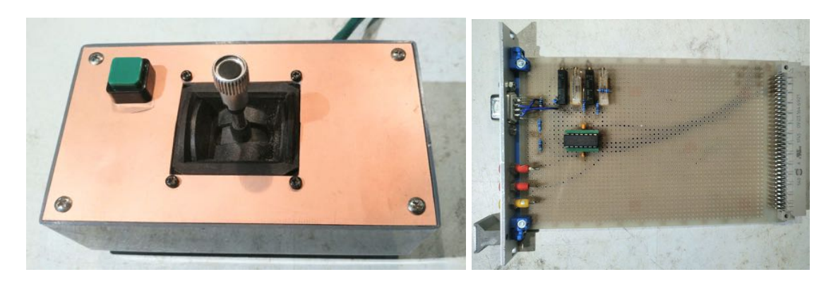
Figure 2: Joystick mounted in enclosure and prototype adapter circuit

will yield a negative value so that either a comparator or an electronic switch (in the case of an Analog Paradigm Model-1 analog computer) can be controlled by this switch.